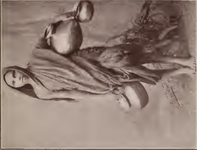
The child-widow described with the brass water pots.